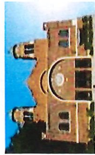
St John the Baptist Catholic Church